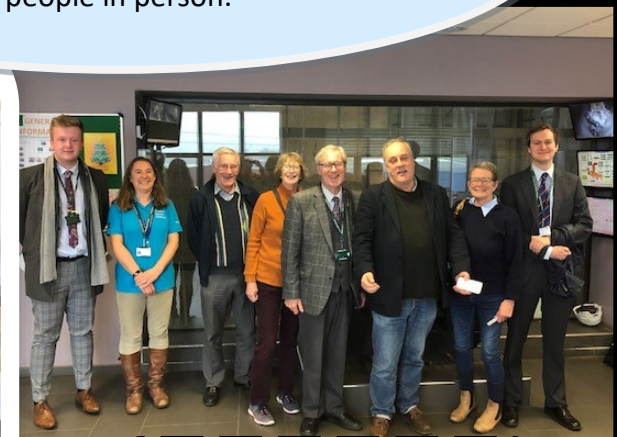
Exeter Energy from Waste Visit