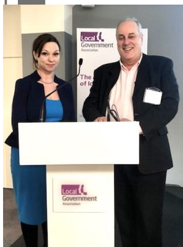
Speaking on Gambling at the LGA

For task group reports, briefings & more click here