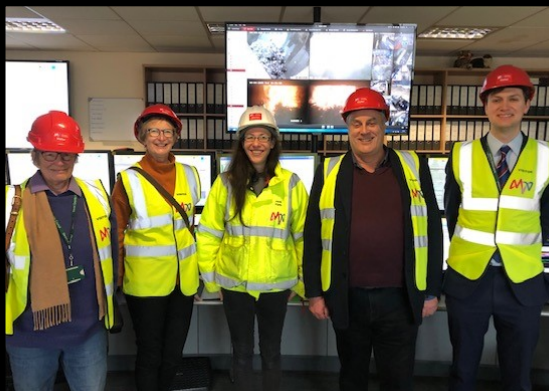
Plymouth Energy from Waste Visit

Responded to public concern over 5G and established a spotlight review, already hearing from 1300 survey responses and 150 people in person.