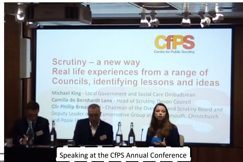
Speaking at the CfPS Annual Conference