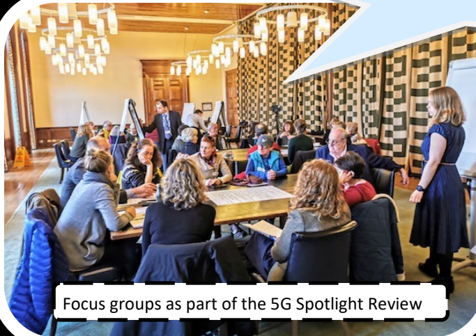
Focus groups as part of the 5G Spotlight Review