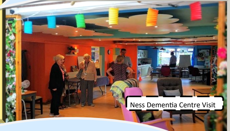
Ness Dementia Centre Visit

Responded to public concern over 5G and established a spotlight review, already hearing from 1300 survey responses and 150 people in person.