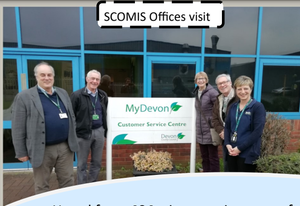
SCOMIS Offices visit