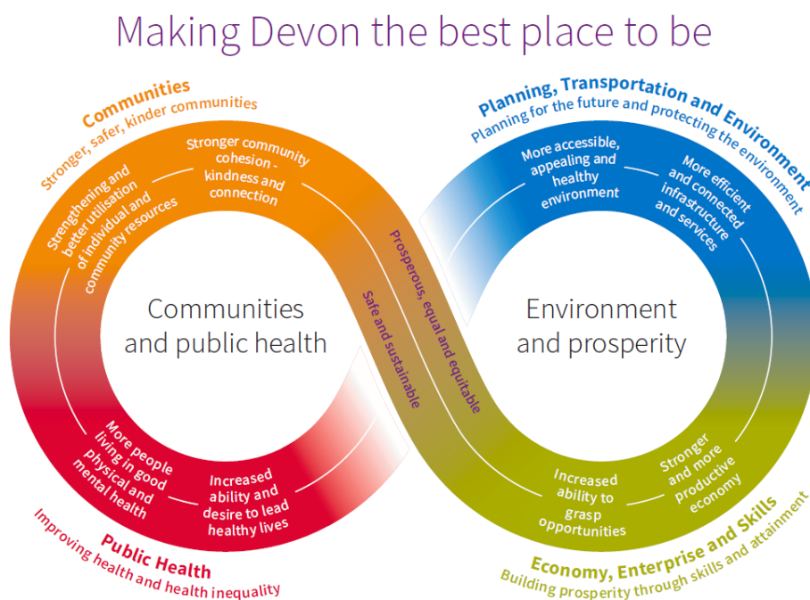
Figure 1: Graphic illustrating the relationship between the four service areas

The prime function of Communities, Public Health, Environment and Prosperity is to develop Devon as "the best place to be" – that our citizens live in safe, strong and supportive communities, living healthy lives, in an environment that is sensitively developed to meet future needs and where our coast, countryside and heritage is protected, and where skills and employment are developed to increase the prosperity of Devon (Figure 1). All these four elements are interrelated – for example, income is the greatest determinant of health – and all have an impact on services required for children and adults. This report covers each of the four service areas in more detail.