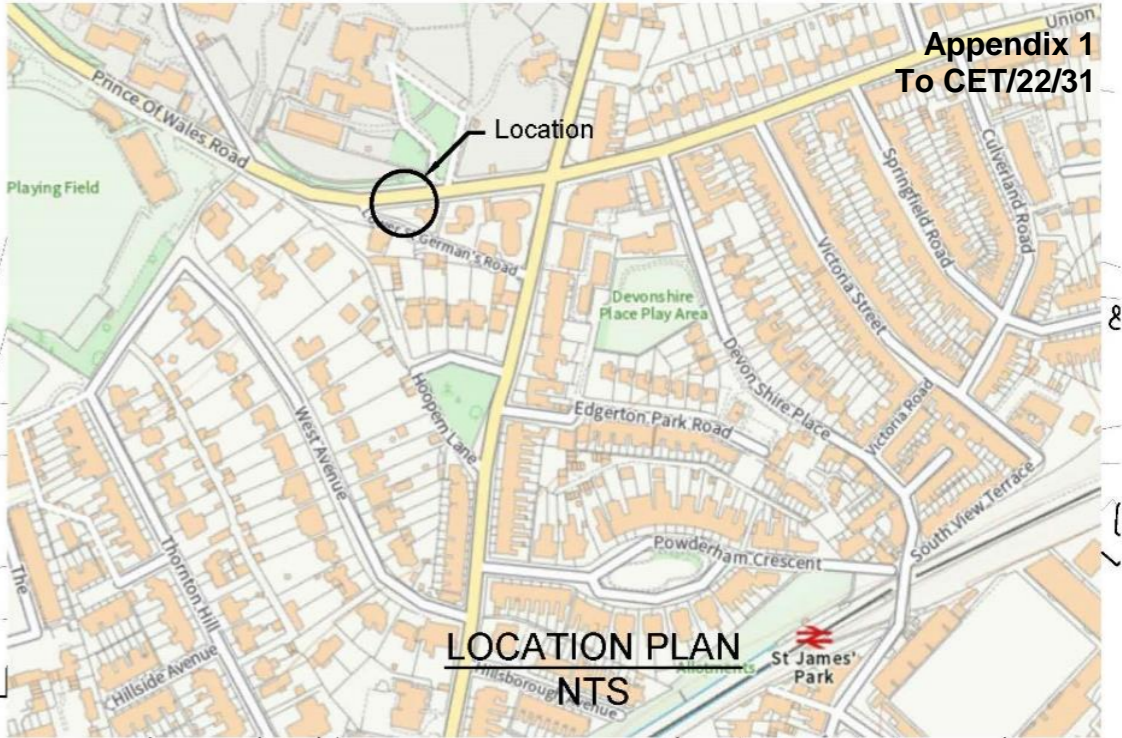
LOCATION PLAN NTS

Area marked in red to be extinguished. Approximately 38.6m squared