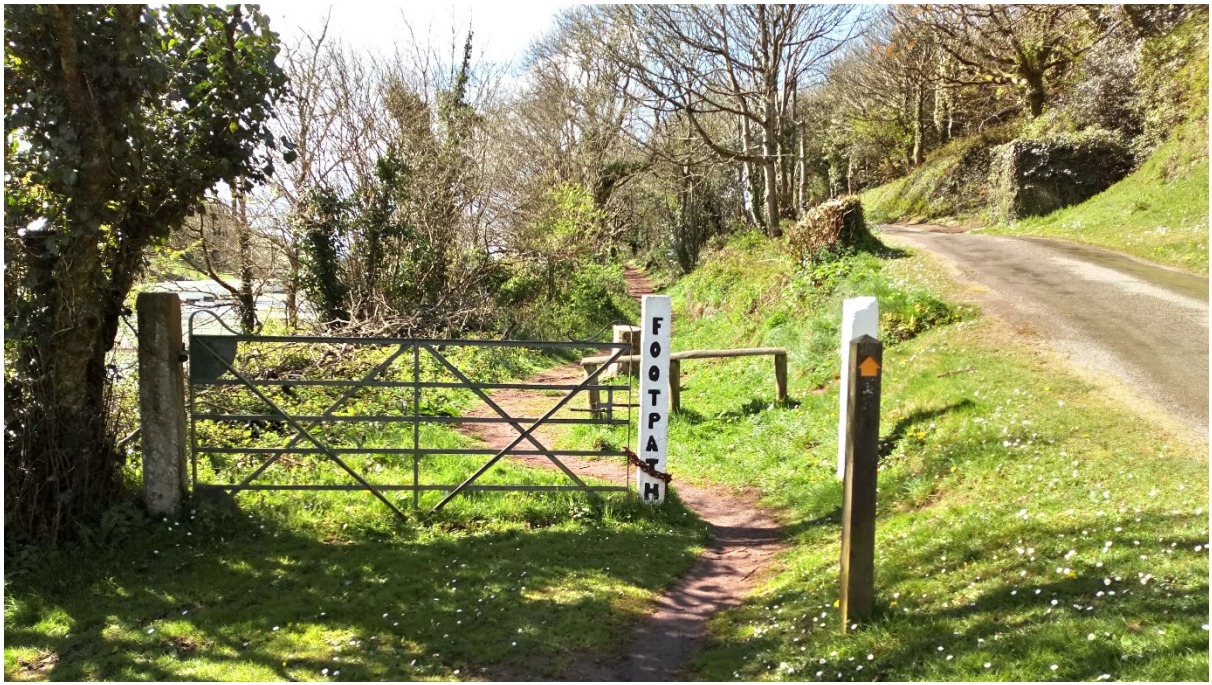
Gate/Gap on the route, west of Bovisand Lodge

Photos are included in the backing papers