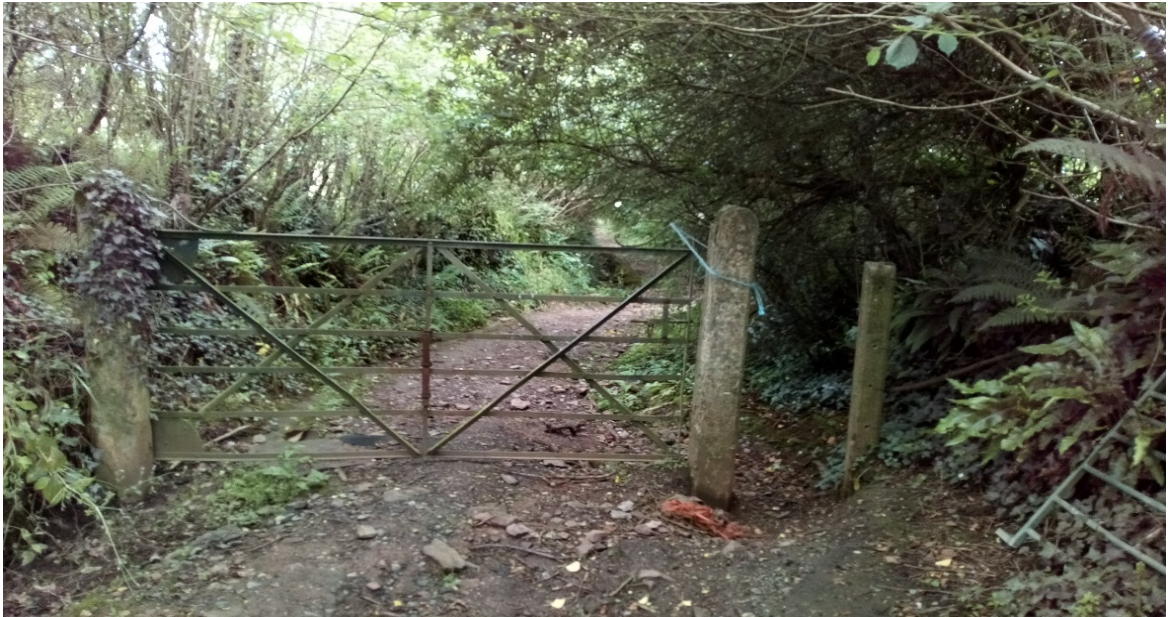
Gate at the top of Bovisand Lane set back from its junction with Little Lane.

1.2.1 Proposal 1 follows the route of Footpath No.1(pt) Wembury. It starts at the county road at the corner with Little Lane and continues into a hedged lane, known as Bovisand Lane. There is a gate across the lane, approximately 10 metres from the county road, which is openable, but walkers pass through a gap between two gate posts and the hedge. The route continues downhill through a hedged lane between fields in a south westerly direction with a small stream running along the southern hedge. The route runs to the north of Bovisand Lodge and across the private drive to Bovisand Lodge Holiday Park. Here, the route is a more open track and continues south westwards and there is a locked gate across the track with a gap adjacent. The gate is clearly marked "Footpath" and there is also a wooden way-marker post with a yellow arrow pointing along the route to the sea. This section of path is fenced to the south and is hedged on the northern boundary. Footpath No.1 joins Footpath No.16 Wembury, part of the South West Coast Path.