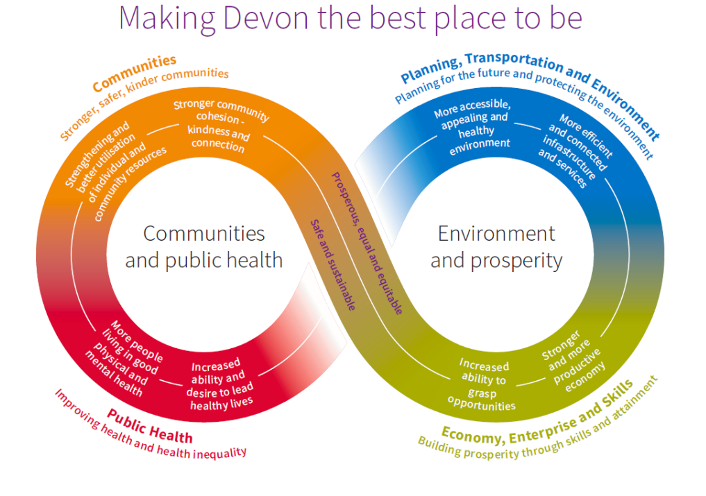
Figure 1: Graphic illustrating the relationship between the four service areas

The prime function of Communities, Public Health, Environment and Prosperity is to develop Devon as "the best place to be" – that our citizens live in safe, strong and supportive communities, living healthy lives, in an environment that is sensitively developed to meet future needs and where our coast, countryside and heritage is protected, and where skills and employment are developed to increase the prosperity of Devon (Figure 1). All these four elements are interrelated – for example, income is the greatest determinant of health – and all have an impact on services required for children and adults. This report covers each of the four service areas in more detail.